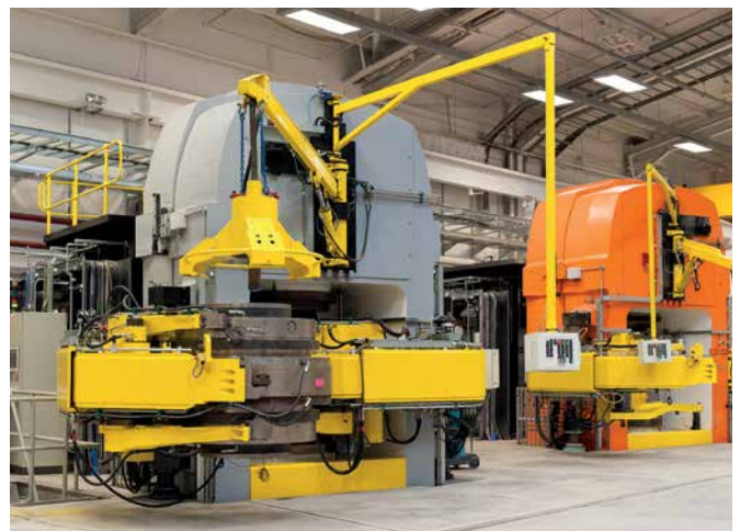
Element Six's unequalled synthesis capability includes the very latest belt and cubic press technology to continuously push the boundaries of materials performance.