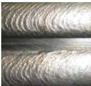
LMC hard facing on pipe surface.

LMC provides enhanced surface protection and life improvements throughout the drill string.