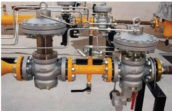
Element Six wear part solutions improve efficiency in topside and subsea valves in the oil and gas industry.

A range of carbide and synthetic diamond materials and components for wear parts such as valves, bearings and turbine parts are available from Element Six, delivering extended component life and reduced maintenance costs throughout the drilling, flow control and production processes.