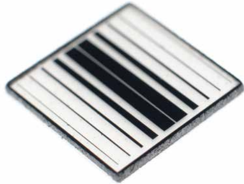
Element Six's conductivity sensor combines conducting and insulating diamond for reliable and continuous sensing in hostile environments.