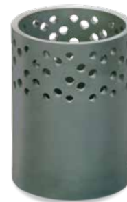
Tungsten carbide chokes and valves can be made to any customer specification.

Element Six offers a wide range of bespoke Tungsten Carbide products developed from 60 years of experience and market-leading expertise. Characterised by extreme strength, toughness and hardness, Tungsten Carbide is highly resistant to wear and high temperatures.