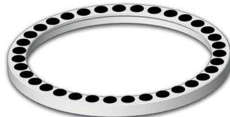
Representative example of thrust bearing made of PCD braised to steel.

These properties make it an ideal material for bearings, delivering high performance, extended life and reduced maintenance costs.